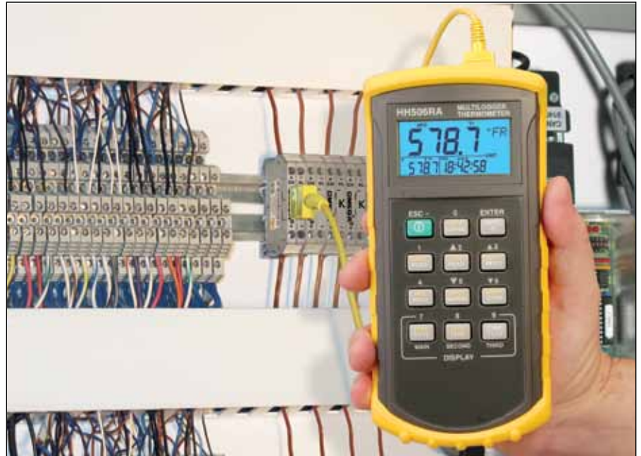
Shown with RECK1-10 cable, and the HH506RA datalogger/thermometer, with RS232C interface.

The new DRTB Series thermocouple terminal blocks are manufactured with thermocouple-grade alloys to guarantee accurate readings. A built-in SMP-compatible female receptacle accepts a miniature thermocouple connector. The female connector allows the user to connect to a handheld meter for applications such as data collection, quality assurance compliance, capability studies and trouble shooting installation or repairs.