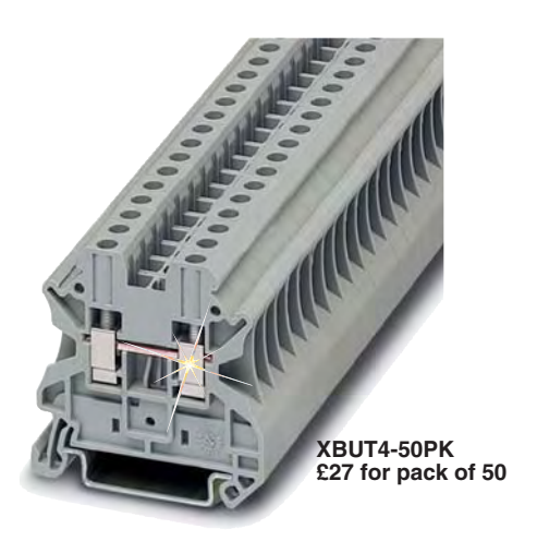
All models shown smaller than actual size.