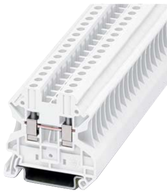
XBUT4WH-50PK £27 for pack of 50