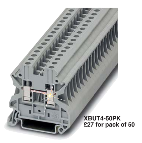
All models shown smaller than actual size.