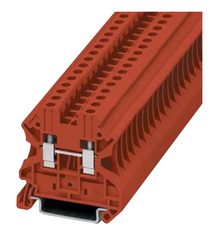
XBUT4RD-50PK £27 for pack of 50

All 3 technologies (screw, spring and IDC) use the same bridge system, allowing for individual potential distribution and quickly bridged connections among the same terminal block type or across different types. The XB Series terminal blocks have 2 bridge shafts arranged in 1 line, making flexible chain bridging and skip bridging between non-adjacent terminal blocks possible. Plug-in bridges are available from 2 to 50 positions. Reducing bridges are also available to connect a larger terminal block to a smaller one.