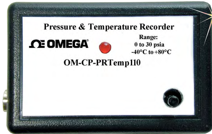
OM-CP-PRTEMP101 and OM-CP-PRTEMP110 dataloggers shown larger than actual size