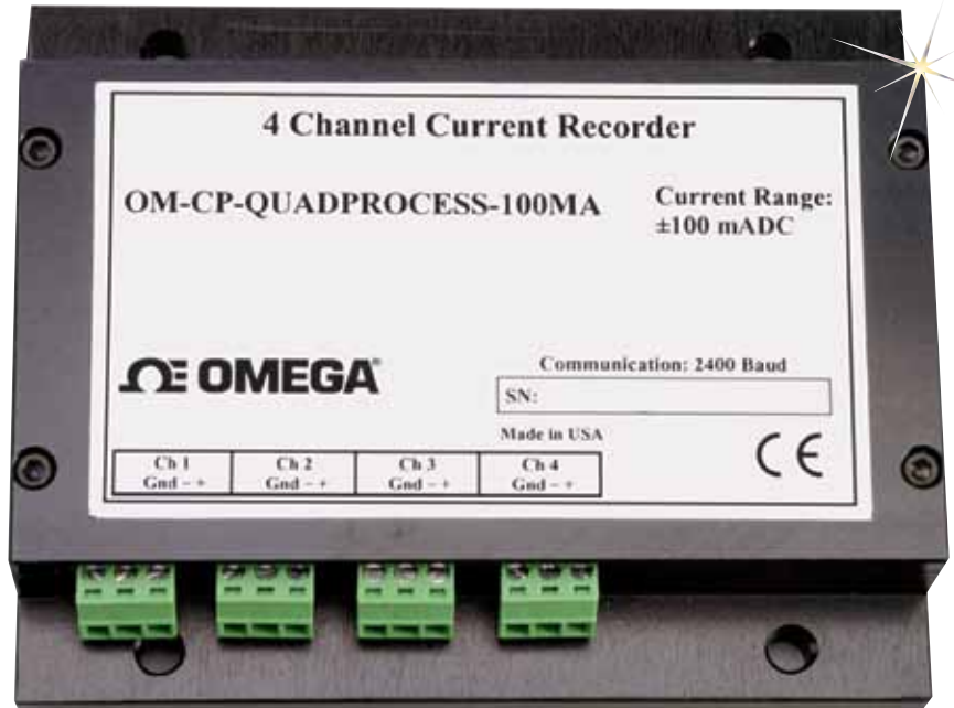
OM-CP-QUADPROCESS-100MA shown actual size.

The software converts a PC into a real-time strip chart recorder. Data can be printed in graphical or tabular format. It can also be exported to a text or Microsoft Excel file.