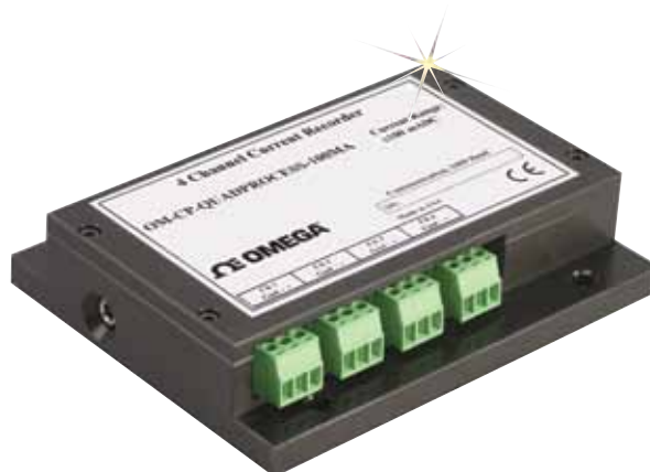
OM-CP-QUADPROCESS-100MA shown smaller than actual size.