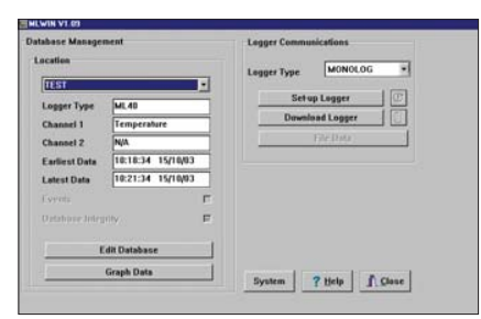
OM-MLWIN software logger configuration screen