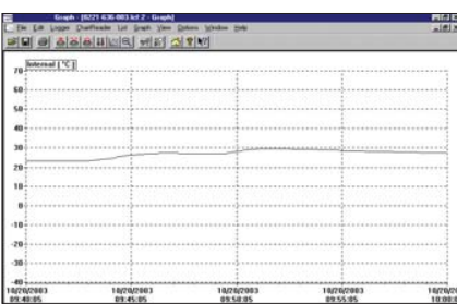
OM-MLWIN software displaying time-based graph of data