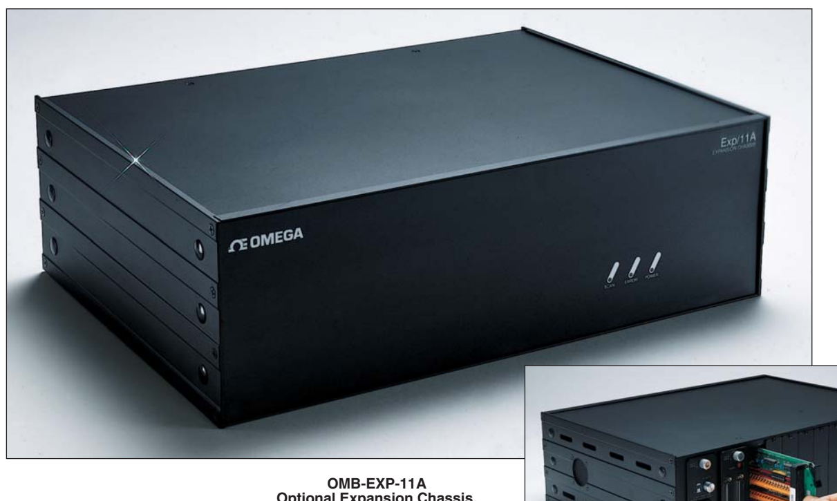
Optional Expansion Chassis, $1999

Also, a 16-bit A/D converter ensures measurement integrity. The A/D converter samples and averages multiple readings, resulting in high noise rejection from ac line pickup.