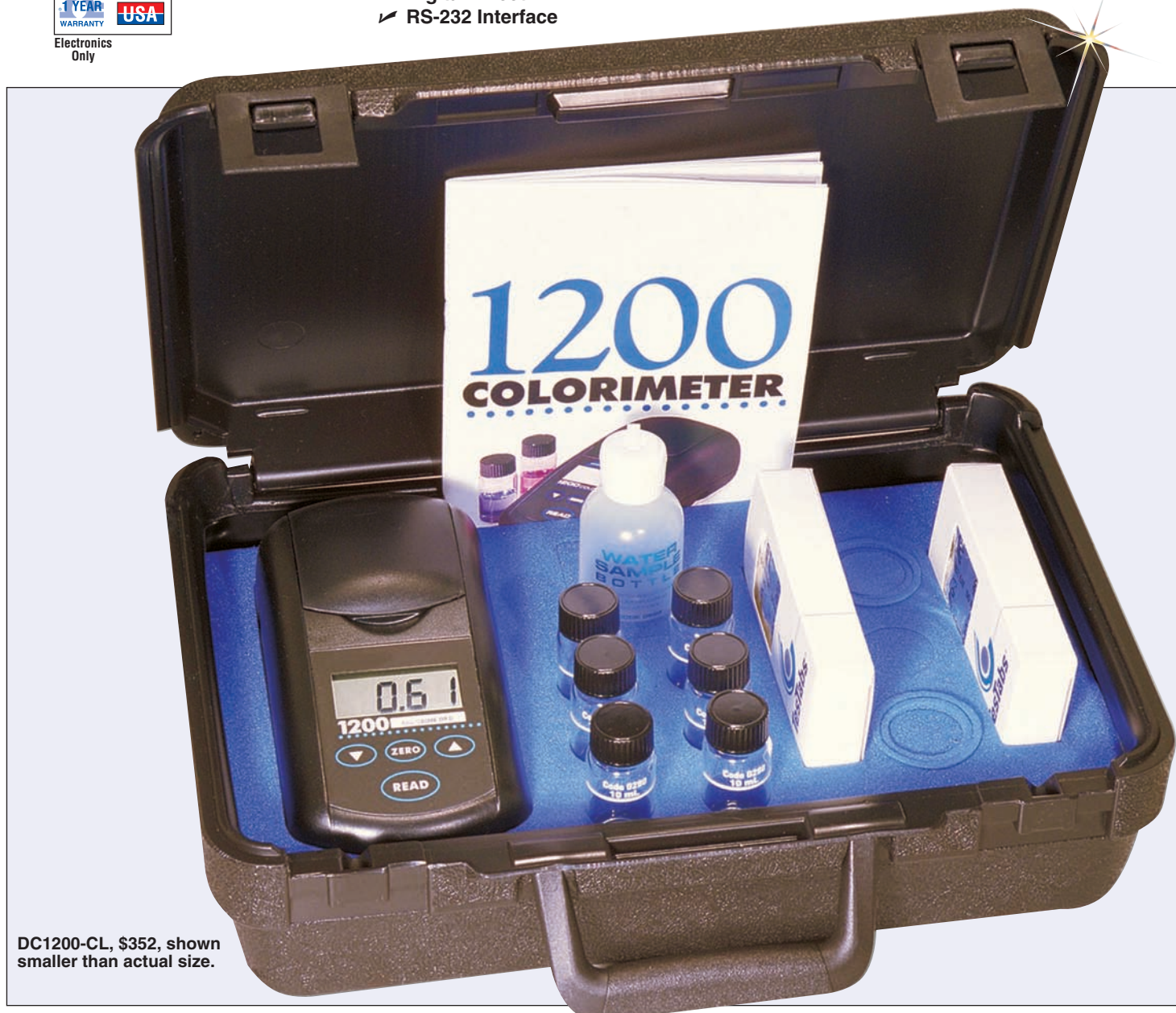
DC1200-CL, $352, shown smaller than actual size.

The new DC-1200 Series of single-test, direct-reading colorimeters incorporates design advances that enhance reliability, improve accuracy and simplify the calibration process—all in a portable, handheld package.