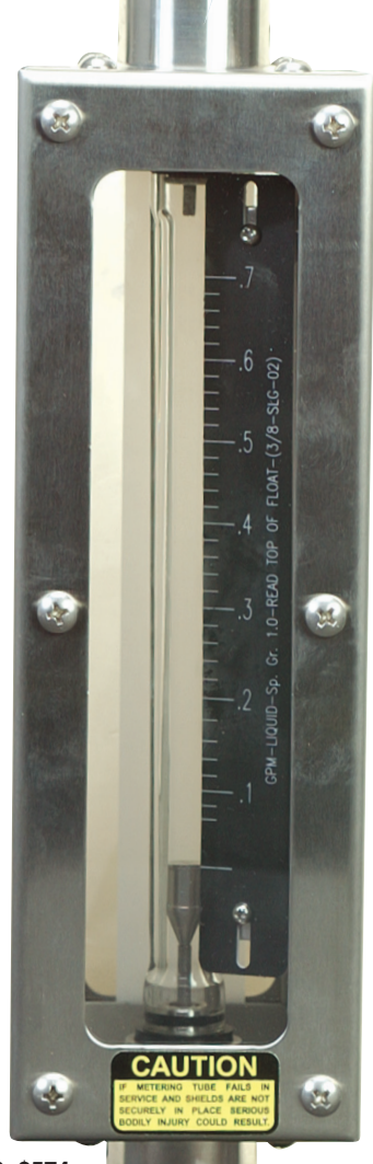
FL601G. $574. shown smaller than actual size.