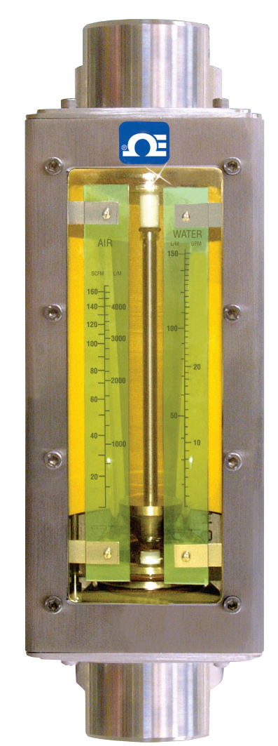
FLD117, $940, shown smaller than actual size.

FLD116-FL. 26 GPM flowmeter for water with optional ANSI 150 flange. $510 + 241 = $751.