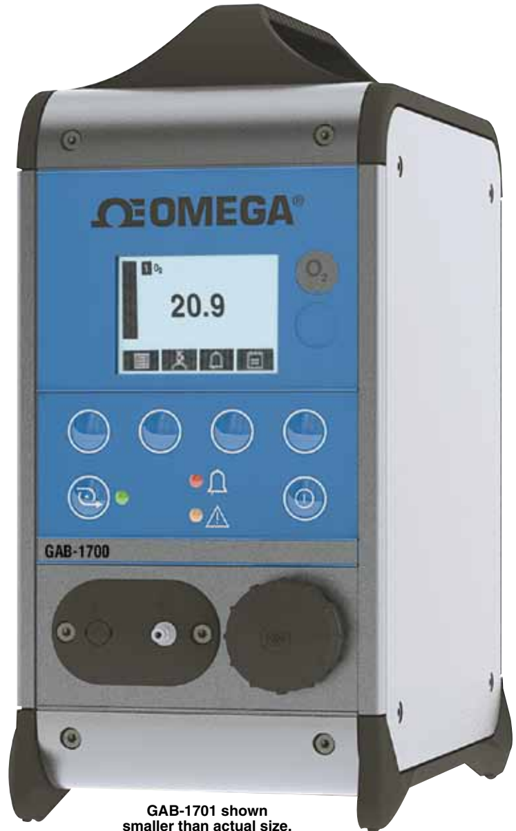
GAB-1701 shown smaller than actual size.

This compact, portable and easy to use instrument is based upon a non-depleting, component specific measurement technique (magnetodynamic paramagnetic) for long life and minimal running costs, avoiding the problems associated with electrochemical or other less robust methods of analysis.