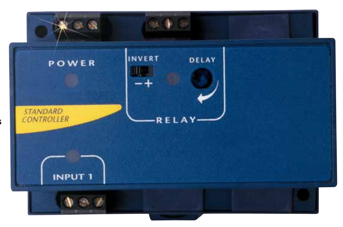
Top view shown larger than actual size.