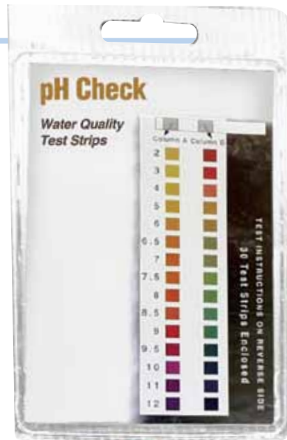
WTS-480104 water test strips.