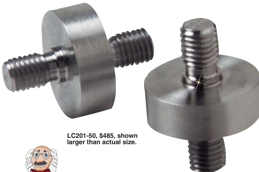
LC201-50, $485, shown larger than actual size.