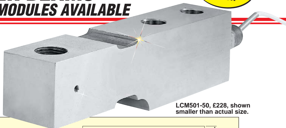
LCM501-50, £228, shown smaller than actual size.