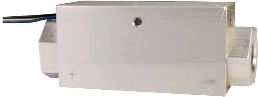
PSW845-1 shown actual size.

The PSW845 is a rugged differential pressure switch, with excellent bypass characteristics. It is able to handle a variety of media to 6000 psig. The PSW845 can be mounted in any orientation, and is capable of withstanding light to moderate mechanical shock and vibratory loads.