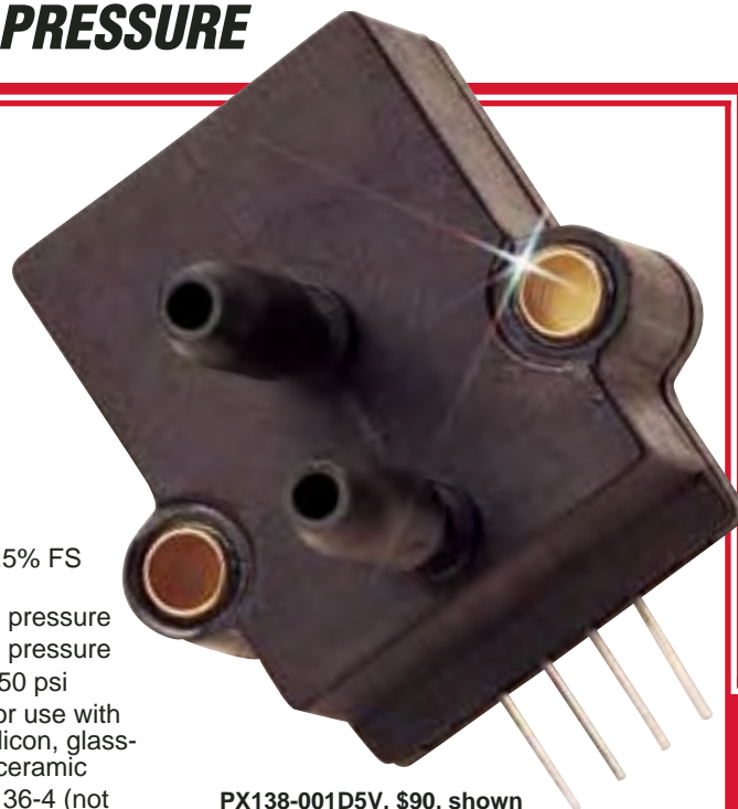
PX138-001D5V, $90, shown 2.5x larger than actual size.

Mating Connector: CX136-4 (not included), see page C-10