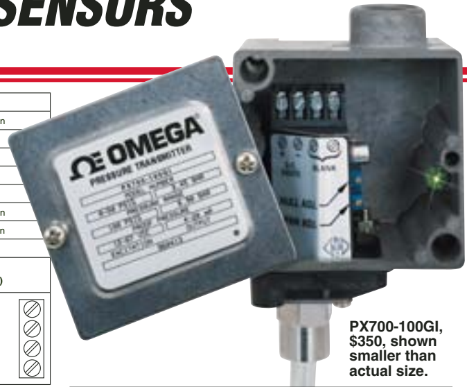
PX700-100GI, $350, shown smaller than actual size.