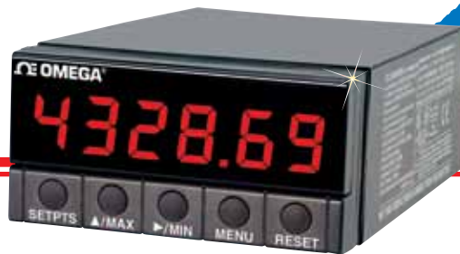
DP41-B, shown smaller than actual size. For details visit omega.com/dp41b