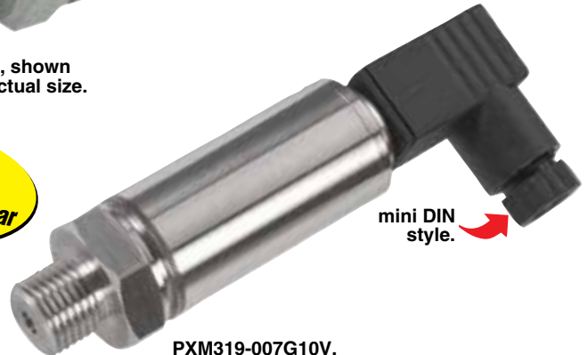
mini DIN style.