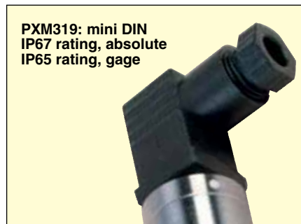
PXM319: mini DIN IP67 rating, absolute IP65 rating, gage