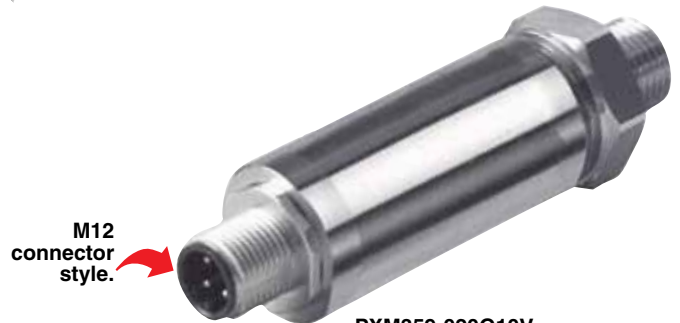
M12 connector style.