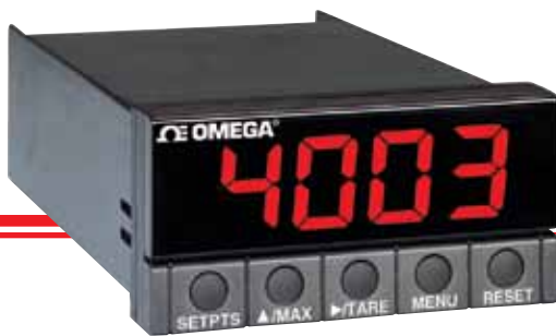
DP25B, shown smaller than actual size. For details visit omega.com/dp25b