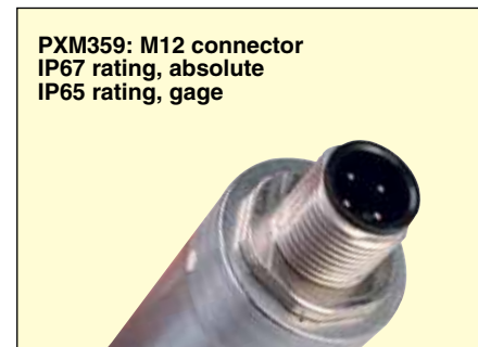
PXM359: M12 connector IP67 rating, absolute IP65 rating, gage