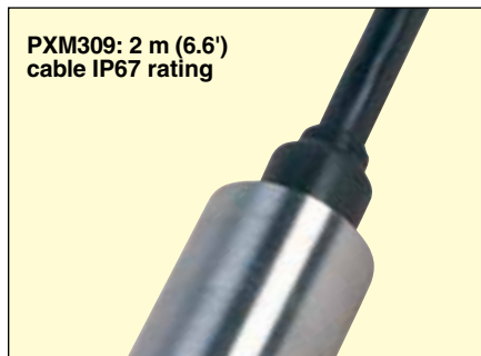
PXM309: 2 m (6.6') cable IP67 rating

precision techniques produce an accuracy of 0.25% FS BSL @ 25°C and a total error band of 1% on most ranges. The PXM309 Series transducers are available in absolute, or gage (relative) pressure and are sealed to an IP65 environmental rating.