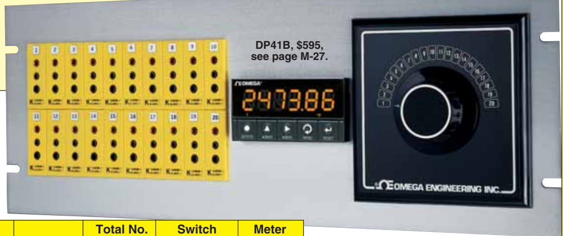
DP41B, $595, see page M-27.