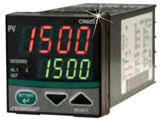
CN6221-R, $195, shown smaller than actual size.

Panel Punches Available Visit omega.com/ panelpunches