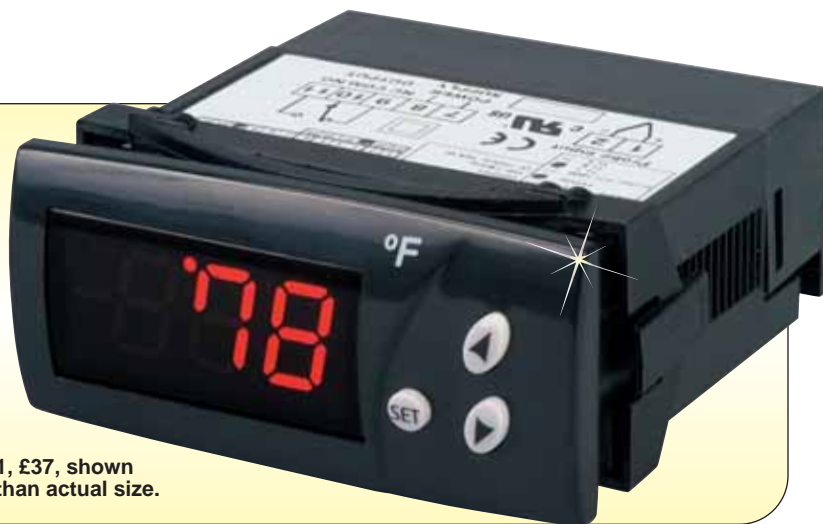
DP7001, £37, shown larger than actual size.