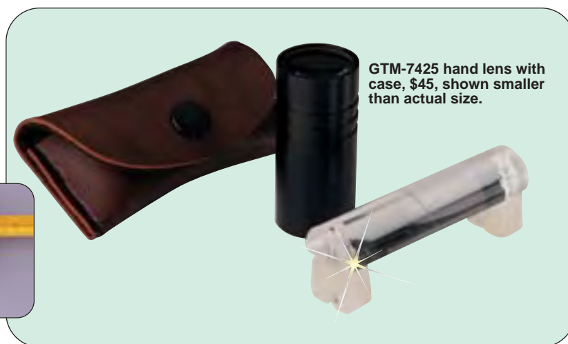
GTM-7425 hand lens with case, $45, shown smaller than actual size.