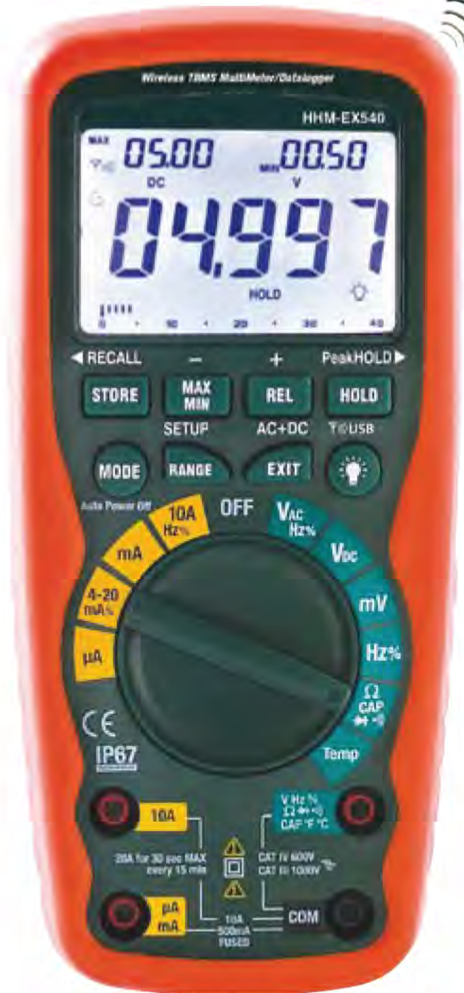
HHM-EX540 shown actual size.

Basic Accuracy: 0.06% DC/AC Voltage: 0.01mV to 1000 Vdc; 0.01mV to 1000 Vac DC/AC Current: 0.01µA to 20A Resistance: 0.01Ω to 40M Ω Capacitance: 0.001nF to 40 µF Frequency (Electrical): 40 Hz to 4 kHz Frequency (Electronic): 0.001 Hz to 100 MHz Temperature: -45 to 750°C (-50 to 1382°F) Duty Cycle: 0.1 to 99.90% Diode Test: Test current of 0.9 mA maximum, open circuit voltage 2.8 Vdc typical Storage Capacity: 9999 records RF Transmit Distance: 10 m (32.8') (approx) Transmitter Frequency: 433 MHz