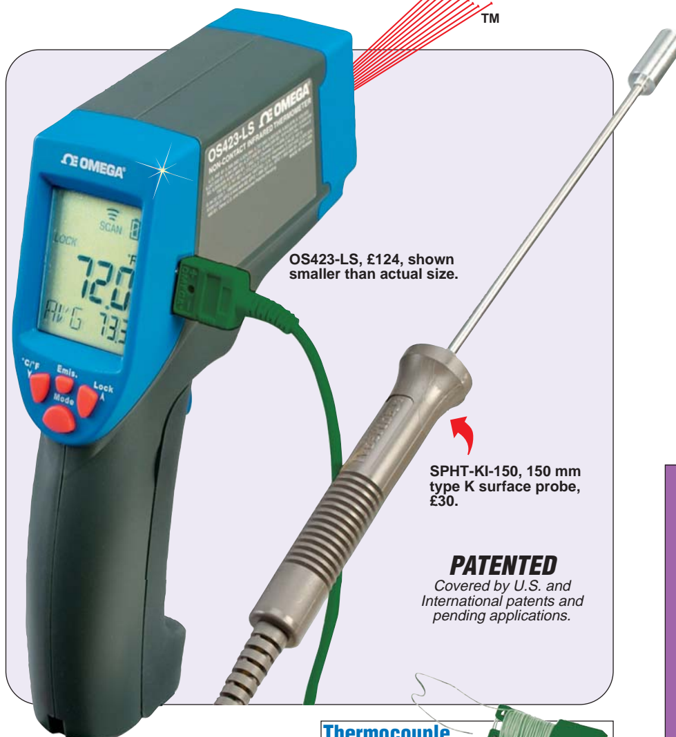
OS423-LS, £124, shown smaller than actual size.

Operating Range: 0 to 50°C (32 to 122°F)